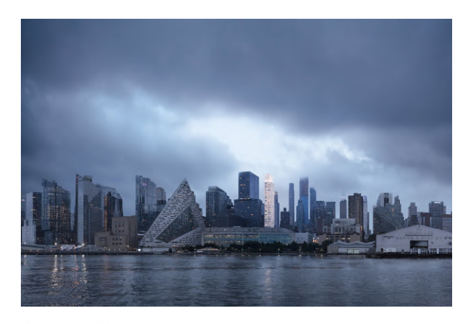
Renderings by The Boundary, courtesy of Compas

Prices range from $1,260,000 for a one-bedroom apartment to $11,245,000 for a four-bedroom penthouse. For more information about available units at 611 West 56th Street, please visit the <u>property website</u>.