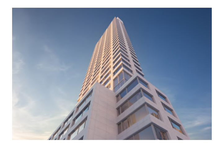
The 450-foot-tall tower reaches skyward, positioned between 11th and 12th Avenues near the Hudson River. White Perla Bianca limestone clads all four sides of the tower's facade, with each stone tile arranged in panels to emphasize the building's different forms and volumes.

Renderings by The Boundary, courtesy of Compass